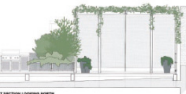
T SECTION LOOKING NORTH