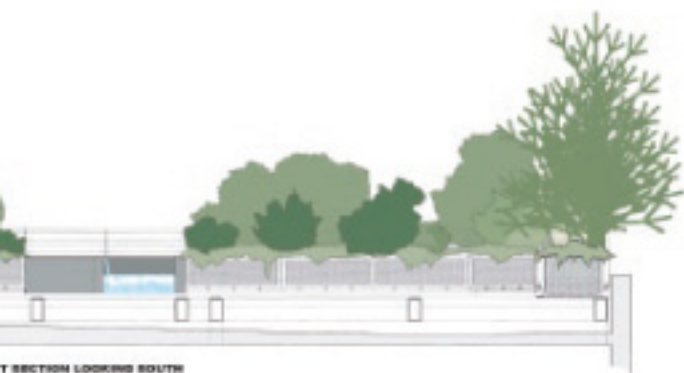
T SECTION LOOKING SOUTH