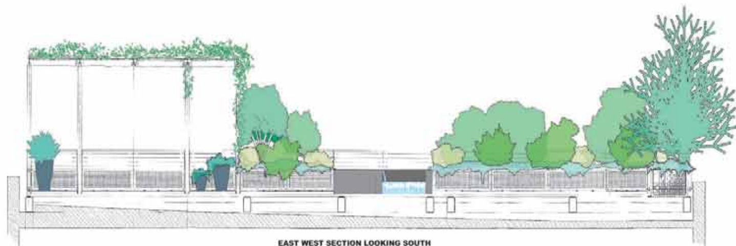
東部圖 South sections (Sawyer/Bennett)