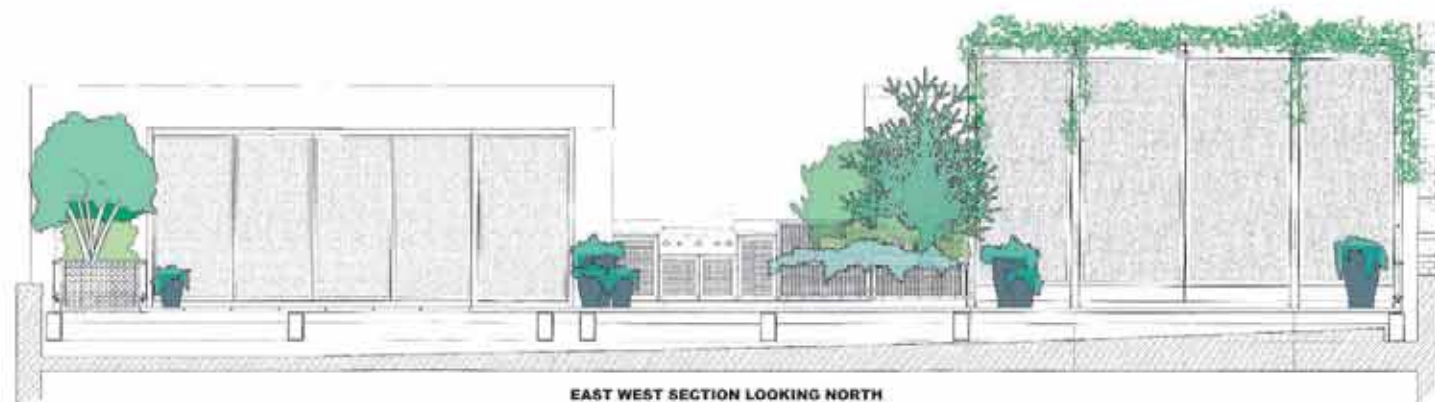
EAST WEST SECTION LOOKING NORTH