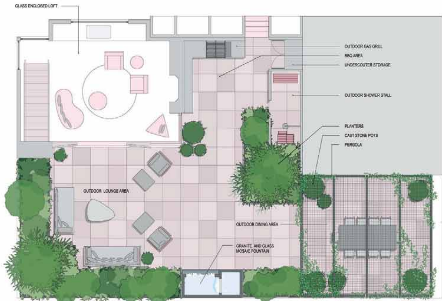
總體透視 Terrace plan (Sawyer/Benson)