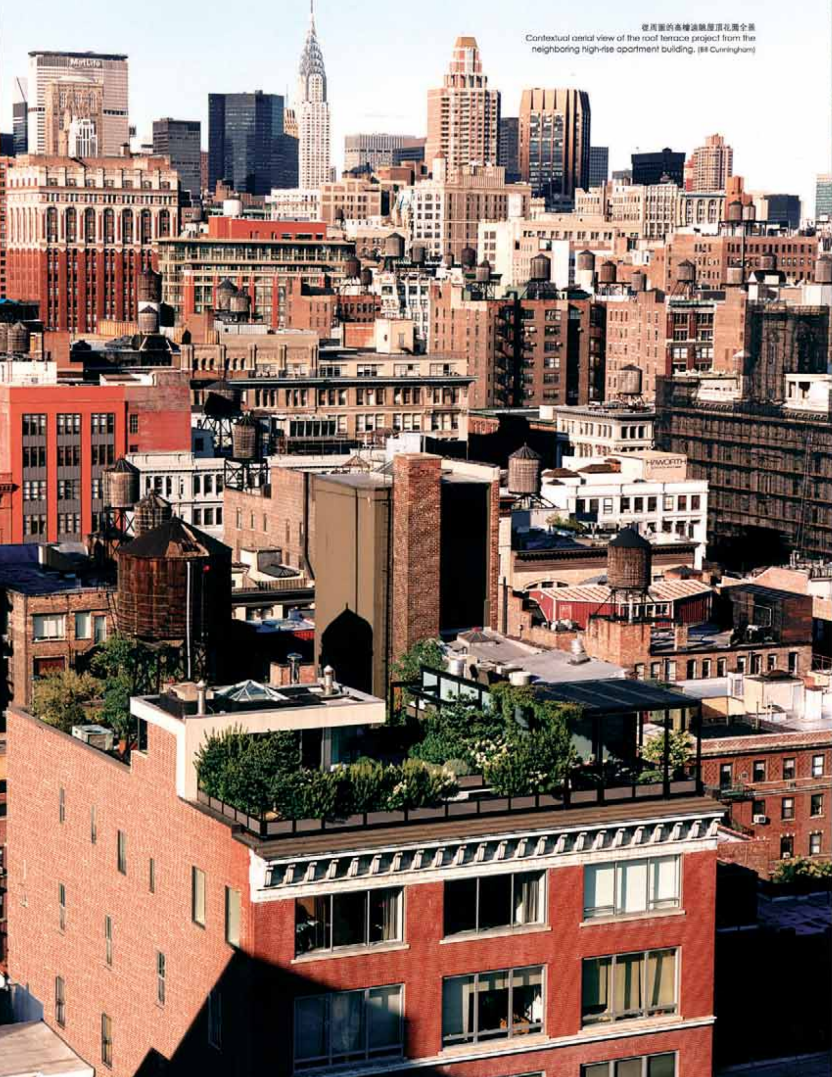
從周圍的高樓俯瞰屋頂花園全景 Contextual aerial view of the roof terrace project from the neighboring high-rise apartment building. (Bill Cunningham)