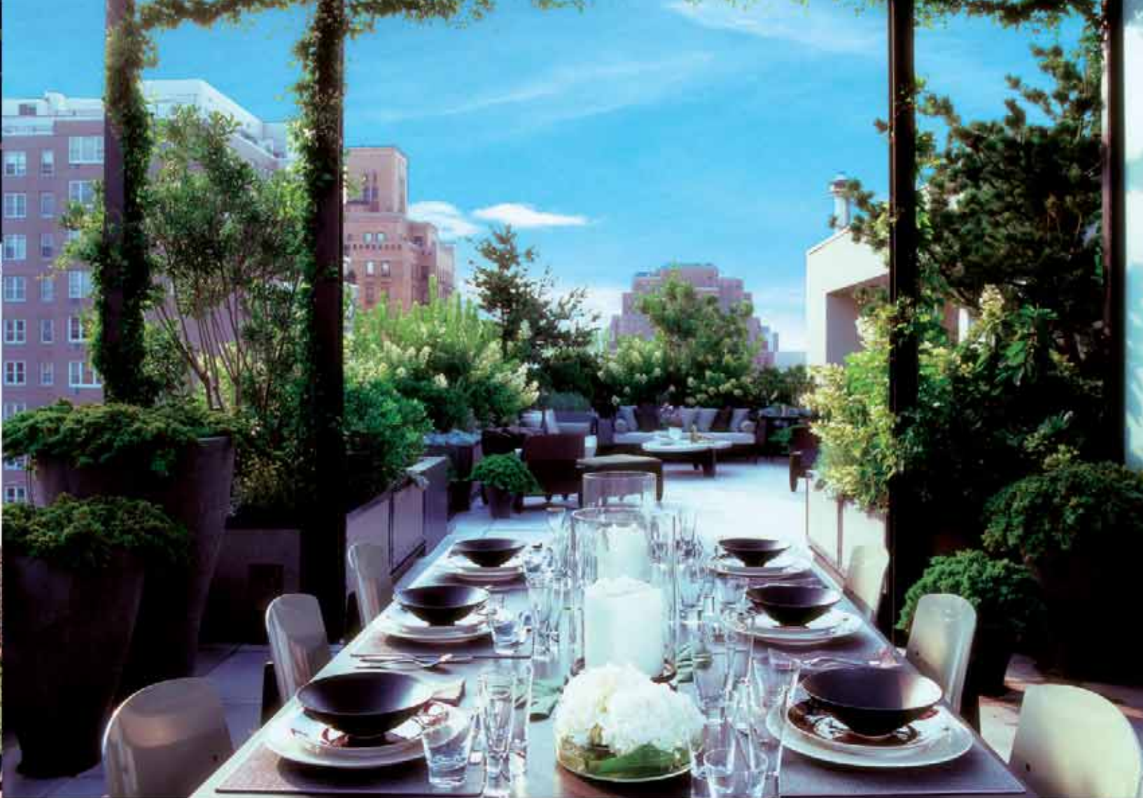
餐廳、藤架和長沙發連成一體，活靈活現地呈現出了綠色家園的感覺 View of the dining area and pergola in foreground with the terrace lounge area beyond. This view is facing west. The penthouse is to the rear right. (Bill Cunningham)

As a requirement by the building management company, the entire roof terrace improvement was designed to be disassembled and removed. The structural steel frame that supports the terrace paving, pergola, fountain, planters and railing is anchored to four columns.