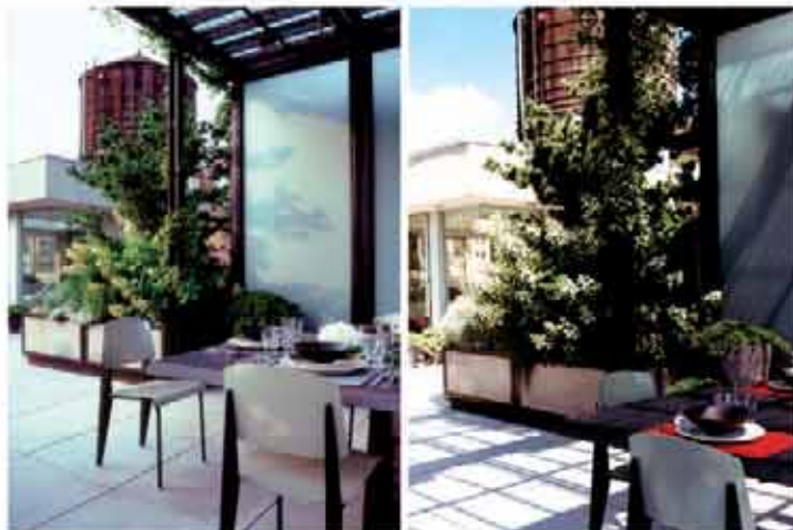
從餐廳望向小屋和小屋上方的大型木槽 View looking northwest from the dining area to the penthouse. The wood house tank is in view beyond the penthouse structure. (Left: Bill Cunningham Right: Dana Galagher)