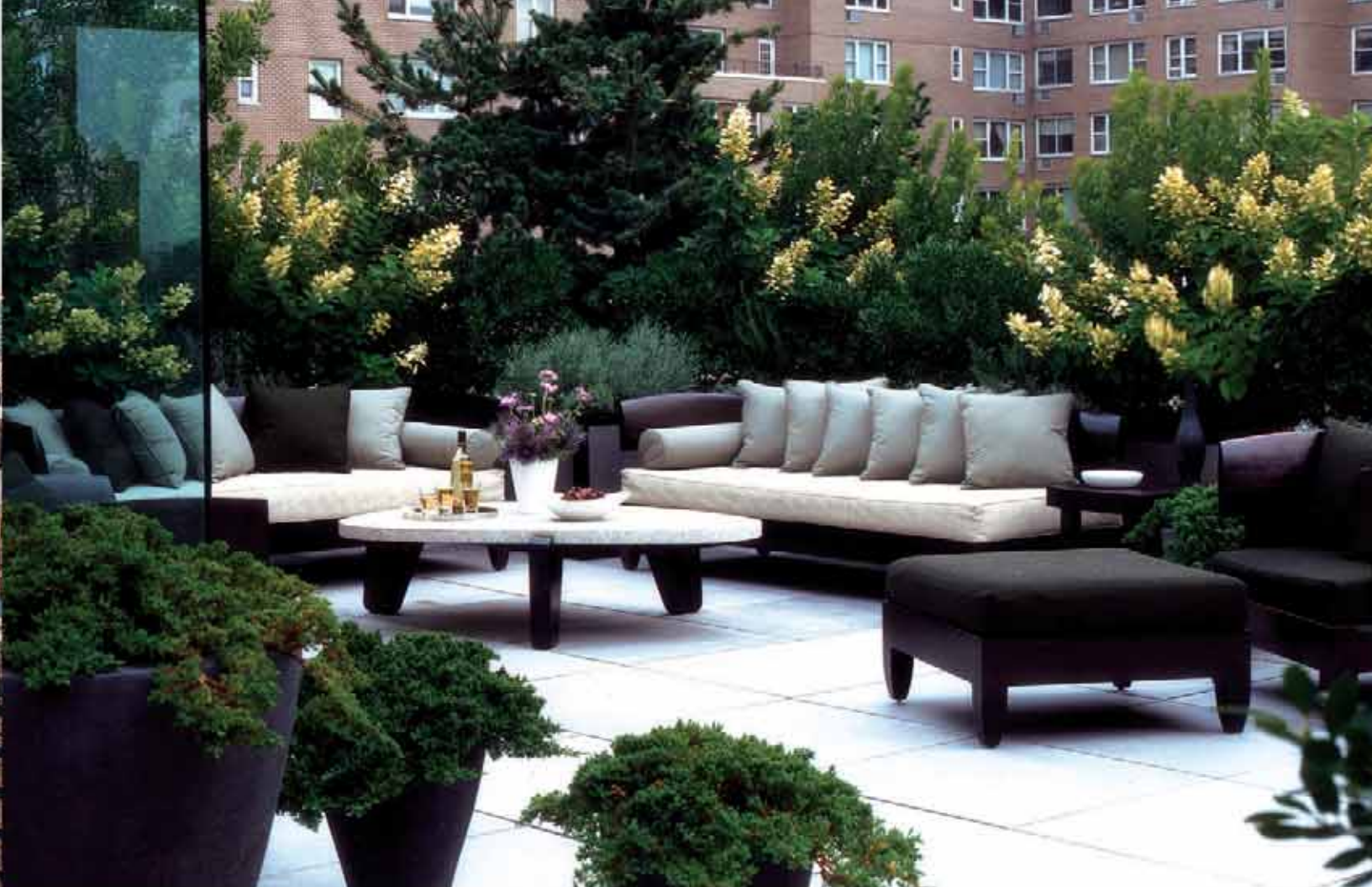
沙發的周圍種植著各色植物，形成了生機盎然的綠色景觀 Terrace lounge area with backdrop of plantings including: Japanese white pine, bayberry, compact inkberry, and 'Tardiva' hydrangea. Dwarf Japanese garden junipers are planted in the cast concrete pots in the foreground. (Bill Cunningham)