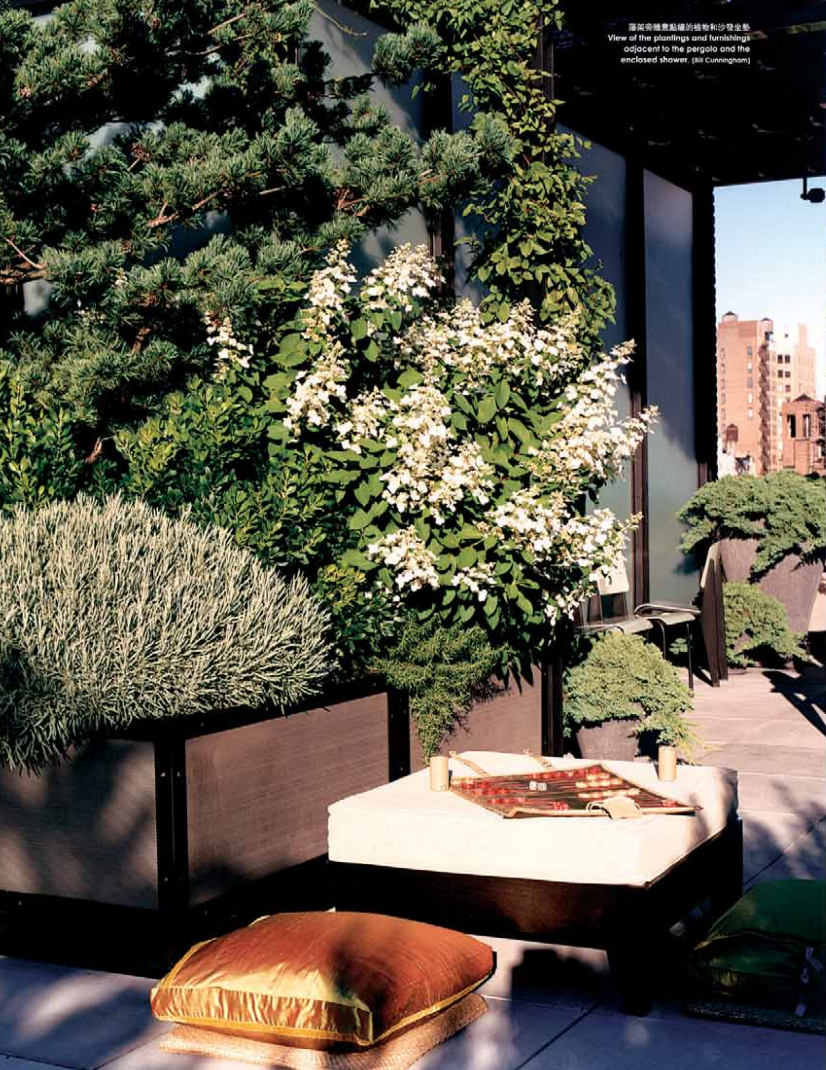
鄰近綠意點綴的植物和沙發坐墊 View of the plantings and furnishings adjacent to the pergola and the enclosed shower. (Bill Cunningham)