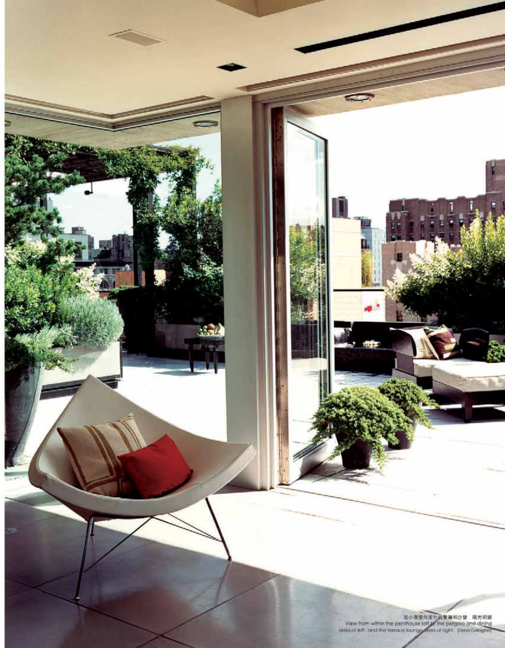
從小屋望向室外餐廳和沙發。陽光明媚 View from within the penthouse left to the pergola and dining area at left, and the terrace lounge area at right.

The terrace includes the following features: Terrace Lounge Area, Formal Dining Area, Pergola over Dining Area, granite and glass mosaic Fountain, BBQ area, outdoor shower, site audio system, extensive site lighting, electronic irrigation system, and six built-in infrared heaters within the pergola structure to extend the outdoor dining season.